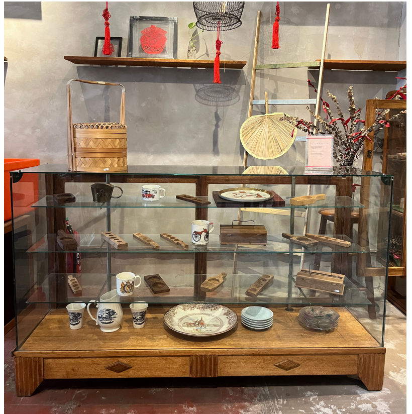
1. Feature Wall Space