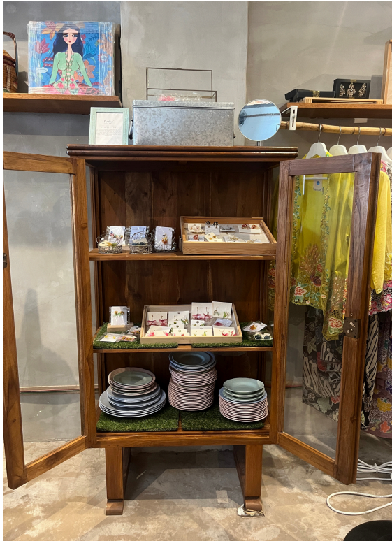
3. Cupboard Space