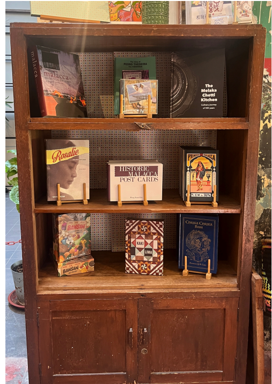
4. Bookshelf Space